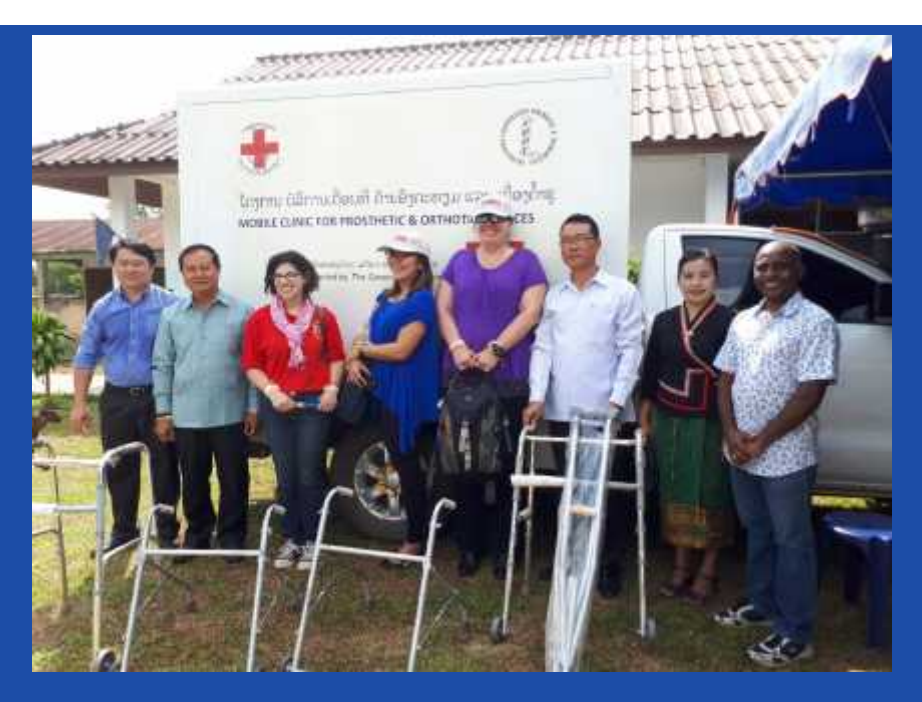
US AMBASSADOR JOINS THE MOBILE CLINIC IN A REMOTE AREA OF SAYABOULY PROVINCE

COPE together with the Government of Lao PDR's Centre for Medical Rehabilitation held two mobile clinics in May 2017, one in Xieng Khouang Province and one in Sayabouly province. During these mobile clinics, over 300 people were screened, resulting in new referrals for prosthetic and orthotic services for over 120 people. Many more benefited from on-the-spot services provided in the field such as device repairs, physiotherapy and distribution of assistive devices including crutches and wheelchairs.